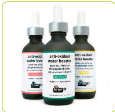
Anti-Oxidant Water Booster by Dr. Brandt

Nicotinamide is a water-soluble component of the vitamin B complex group that has been shown to help with the inflammatory component of acne. A prescription acne supplement called Nicomide by DUSA Pharmaceuticals, Inc. (Wilmington, Mass.) combines vitamin B, folic acid, zinc and copper. This supplement, which also is available in generic form, has data to support that its use, in combination with topical tretinoin produces superior results as compared with topical tretinoin alone.