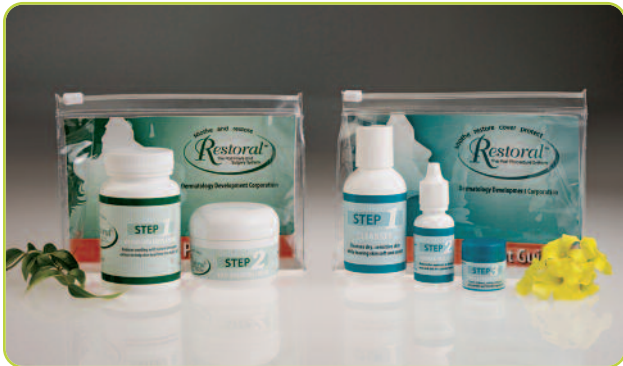
Restoral by Dermatology Development