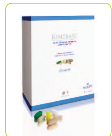
Kinerase Vitamins by Valeant Pharmaceuticals