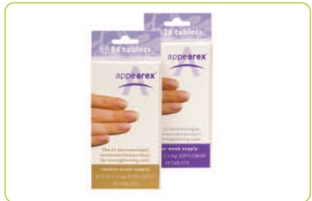
Appearex Supplements by Merz Pharmaceuticals

Another water soluble B-complex vitamin, Biotin, has been shown in clinical studies to strengthen and improve the quality of brittle nails. Biotin is the active ingredient in Appearex from Merz Pharmaceuticals, Inc. (Greensboro, N.C.).