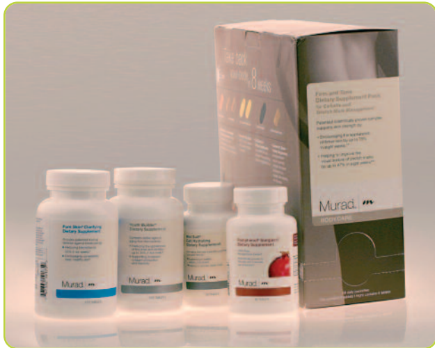
Supplements by Murad

Silver, N.J.), recently launched a line of antioxidant water boosters. Available in a variety of flavors, these extracts offer the nutritional equivalent of 15 cups of green tea. According to Lynne Gerhards, a certified nutritional counselor and co-founder of Pure Inventions, "They are a pure shot of antioxidants which are important to fight free radical damage which causes premature aging."