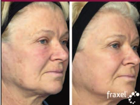
Before Tx After Fraxel Tx

"We now have a device that can be used aggressively and safely on the neck, hands and arms for sun damage and skin tightening."