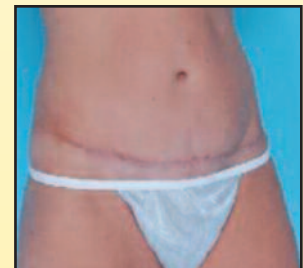
Four months post-operative