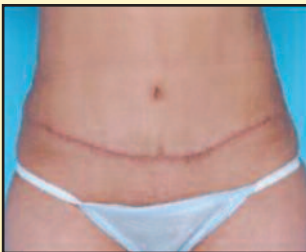
Two months post-operative