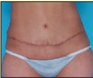
One month post-operative