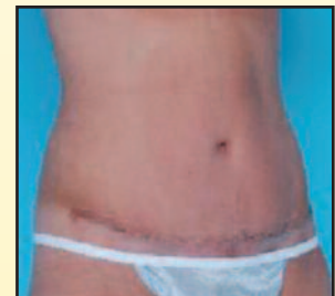
One month post-operative