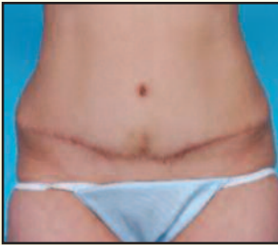
Pre-operative revisional abdominoplasty

"The biggest benefits of Quill SRS, as I see it, are being able to go faster in the deeper layers, and you can also facilitate closure in the superficial layers."