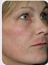
After Lumenis One Tx

"By choosing the Lumenis One, I no longer need an alexandrite, KTP or pulsed dye laser."