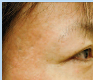
After four Pixel treatments