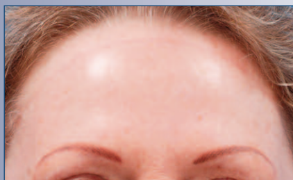
Five weeks after ProFractional XC Tx